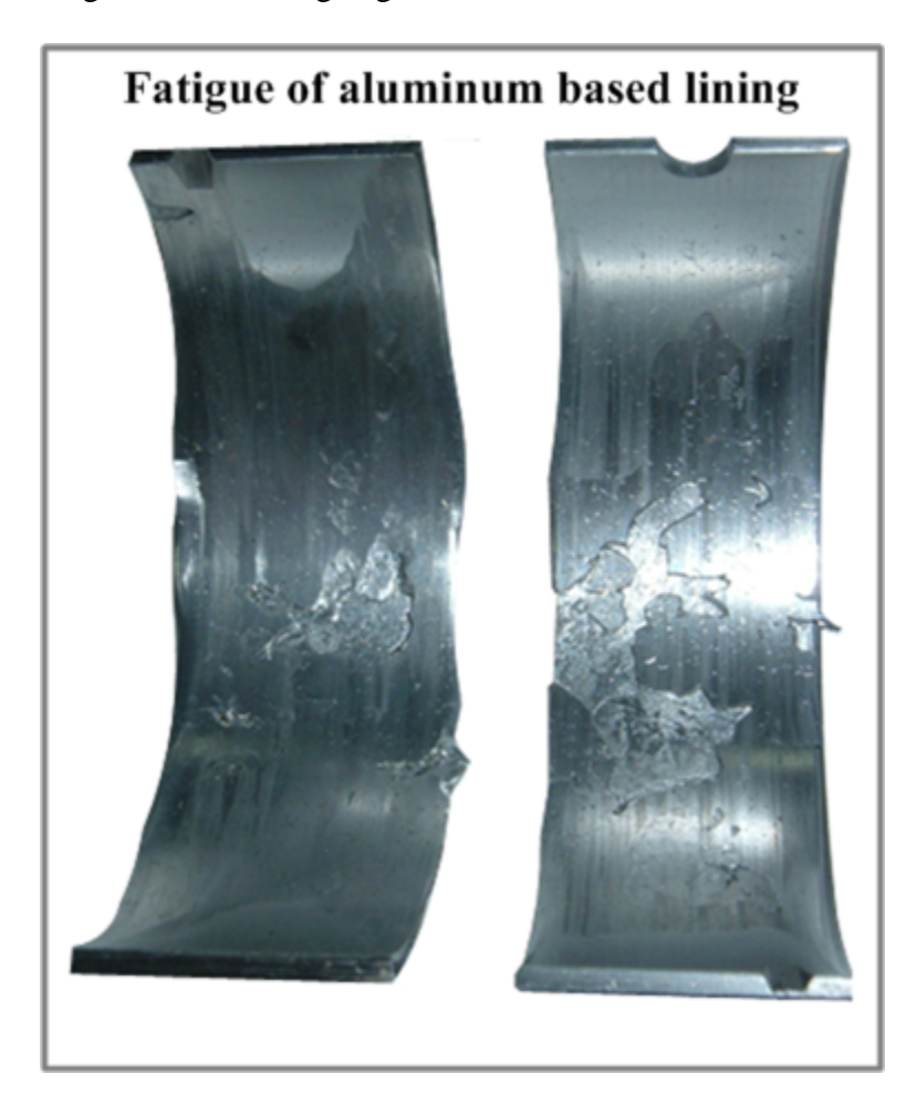
Fig.2 Fatigue of aluminum lining of bi-metal bearings

Fatigue of aluminum alloys may also cause extrusion of the lining material past the length of the bearing edges.