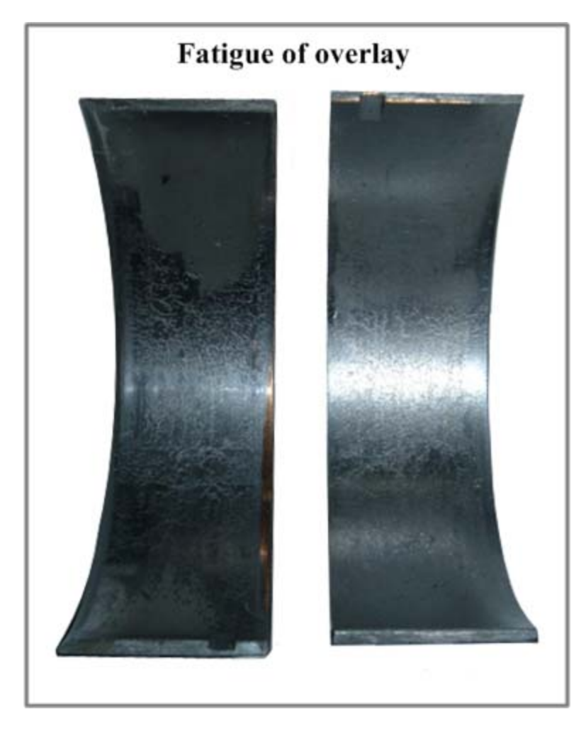
Fig.3 Fatigue of the overlay of tri-metal bearings

However, running the bearing with fatigued overlay may cause partial flaking of the overlay, lowering the oil film thickness and eventual seizure of the exposed intermediate layer.