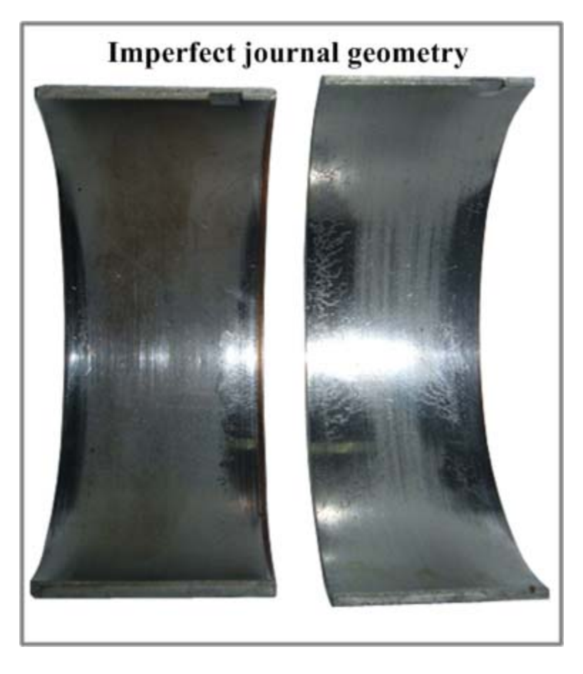
Fig. 6 Imperfect journal geometry

Fatigue cracking of the bearing materials may occur in the contact areas.