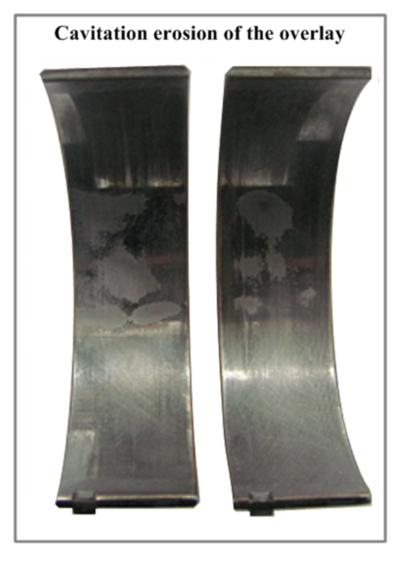
Fig.7 Cavitation erosion of soft lead based overlay

Soft lead based overlays of tri-metal bearings are prone to the cavitation erosion. Therefore replacement of tri-metal bearings with babbitt overlay with bi-metal material or with high strength tri-metal bearings (e.g. GP) will prevent the failures due to cavitation.